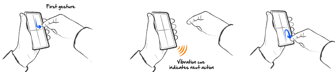
Figure 1. Example of first three steps when entering H4Plock. The user is presented with a vibration cue after entering a gesture, to indicate whether the following gesture to be entered should be selected from the primary or secondary passcode. This process will continue until up to a total of four gestures have been entered.

The user has the ability to abort an entry attempt by selecting the back key on the system, if he/she thinks that an erroneous gesture has been entered. Similarly, should the user forget a passcode, this can be reset using the system. Further details are described in Ali et al. (2015).