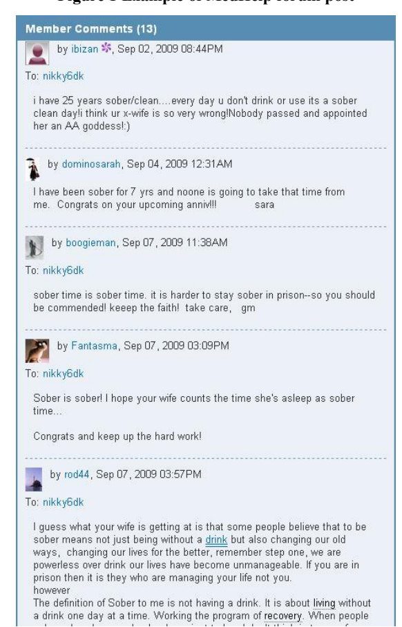
Figure 2 Example of MedHelp forum comments