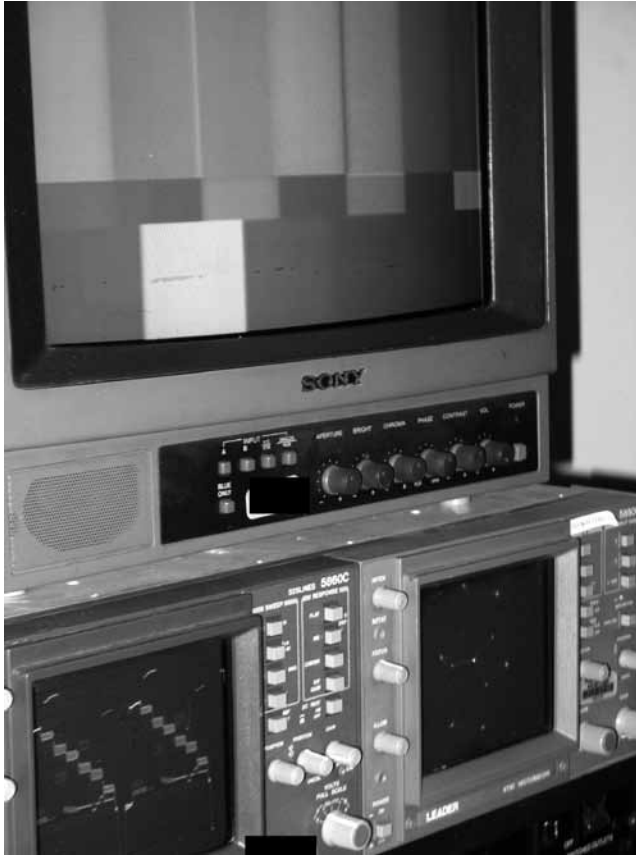
Figure 1. Example of video rack

within their video transfer lab, in which a series of analog and digital components are wired together, with the measurement and adjustment tools placed at critical points in the “signal chain.” This allows for the analysis and adjustment of signal characteristics at each stage and for feedback to be obtained on the effects of those adjustments. This ensemble of tools represents a prototypical assemblage of components that was identified by observing participants’ workplace settings and how they carry out their work, with minor variations to this prototypical system observed across the different sites studied in this research. This presents a common sociotechnical assemblage that shapes the problem space of archival video digitization work. 13